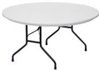
4ft round table Suitable for 6-8 people