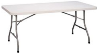
6 ft trestle table Great for Buffet/Bar/6-8 people